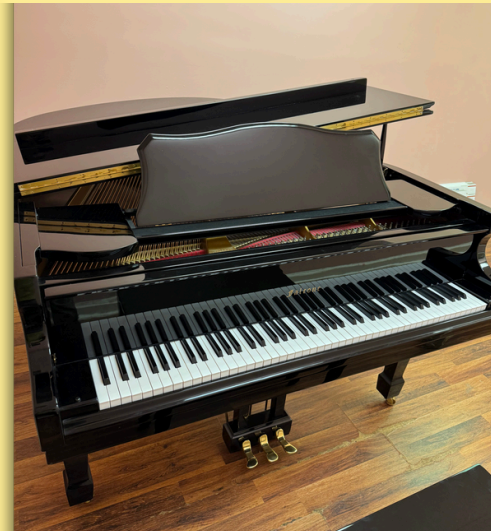
Triad Music Academy Studio D, complete with a 5'3" Falcone GP-52 baby grand piano.

students with lessons to make music for a lifetime on piano, voice, guitar, and violin.