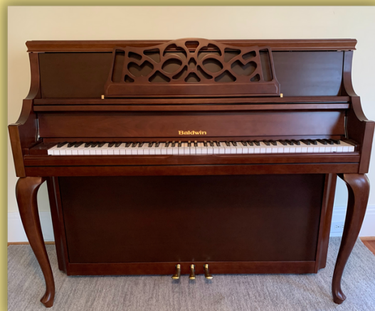
My Baldwin upright piano, purchased at PMC in May of 2018