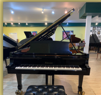
The Falcone concert grand piano at Piedmont Music Center