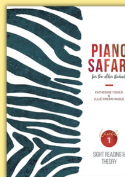
Piano Safari for the Older Beginner, Book 1.

For most adult students, Faber Adult Piano Adventures is a solid choice for a manageable, fun piano lesson experience.