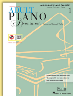
Faber Adult Piano Adventures, Book 1.

As I wrote about last August in Finding Balance: Middle C Method Books , The Faber Piano Adventures series breaks up its material into child, older child, and adult beginner editions.