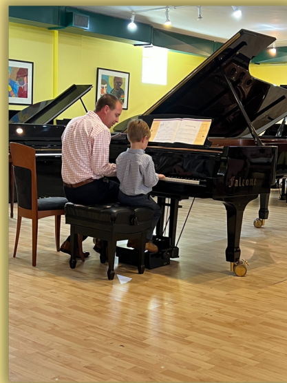
Father-Son Piano Duet in Recital at Piedmont Music Center

On that note, at our recital last month, we even had a father-son duet performance! This is a fantastic way to build a family passion for the piano, and I encourage it heavily. There's even a video somewhere out there of me playing my first recital performance with my own mom as my duet partner.