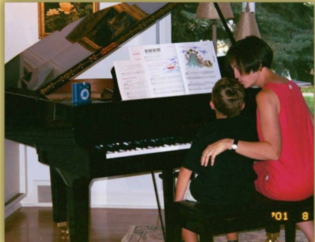
My Mom Playing the Piano with Me Circa 2001 - Whitefish Bay, Wisconsin

Here's hoping every pianist can find a duet partner!