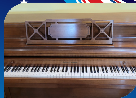
Kohler & Campbell