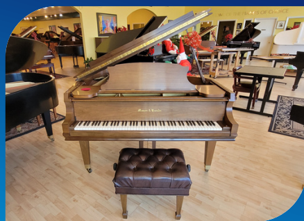
Mason & Hamlin