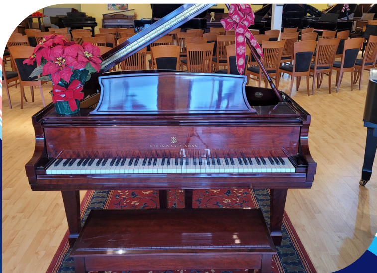
Steinway & Sons ★

SPECIAL PRICING FOR ALL TMA FAMILIES IN THE MONTH OF JULY