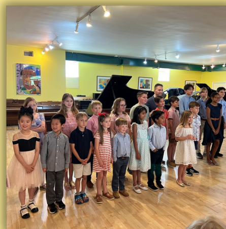
Performers On Stage Together

On June 3rd, twenty-three Triad Music Academy students performed in recital at Piedmont Music Center in downtown Winston-Salem. All did a splendid job and some students performed as many as two or three pieces. Here are some highlights from the performance. Bravo to all of our wonderful, lifelong pianists!