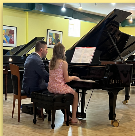
Piano Duet in Recital