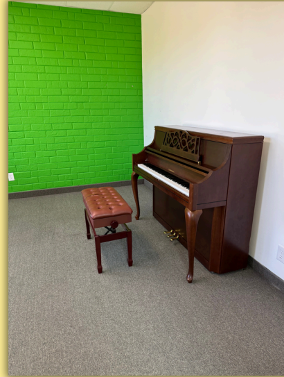
Triad Music Academy Studio C, complete with a Baldwin upright piano.

At TMA, our goal is to provide our students with lessons to make music